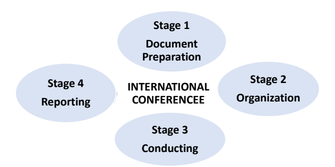
Fig. 2. The stages of The International Conference

certain stage of the conference and ensures its effectiveness. These stages are shown in Figure 2 .